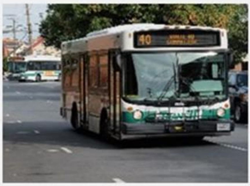
Federal Transit Administration