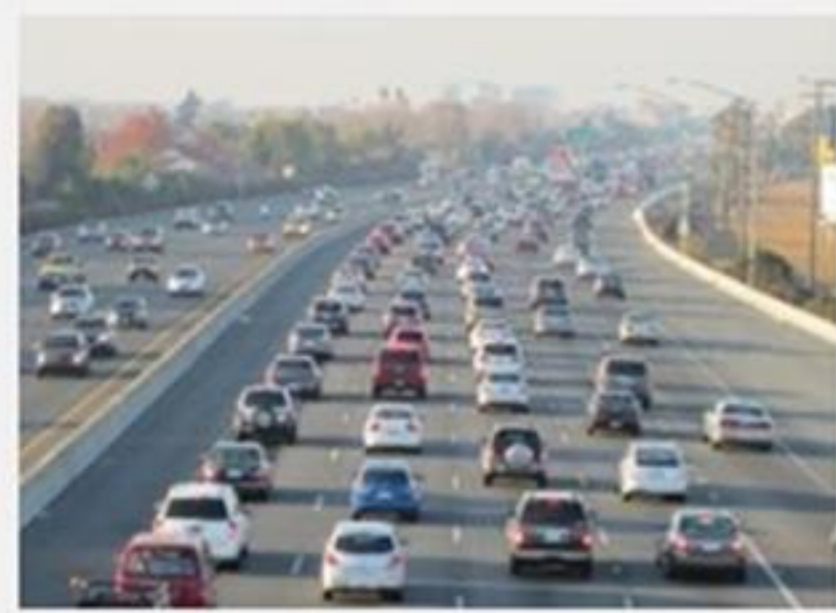
Federal Highway Administration