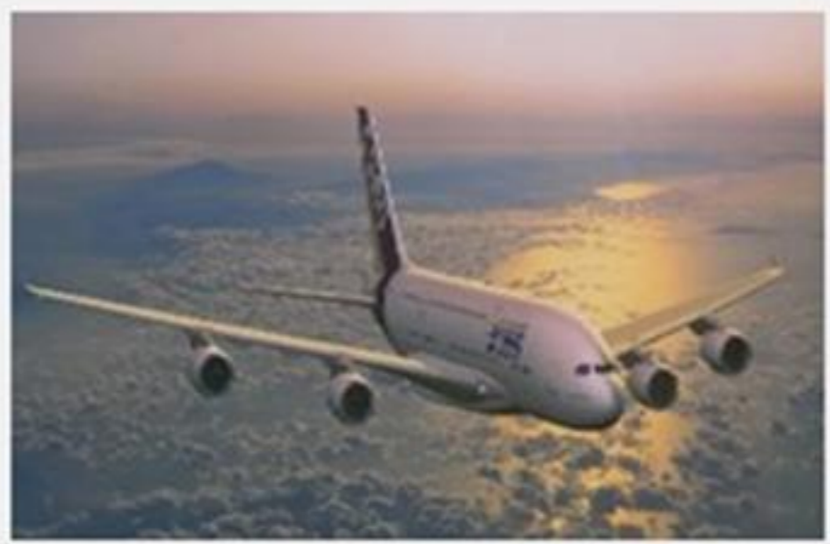
Federal Aviation Administration