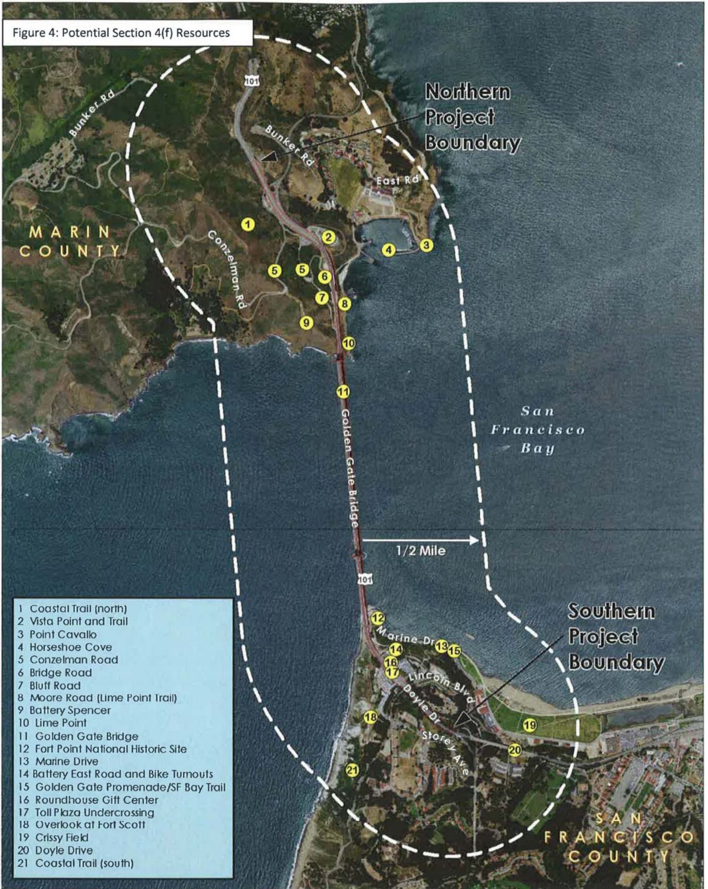
Figure 4: Potential Section 4(f) Resources