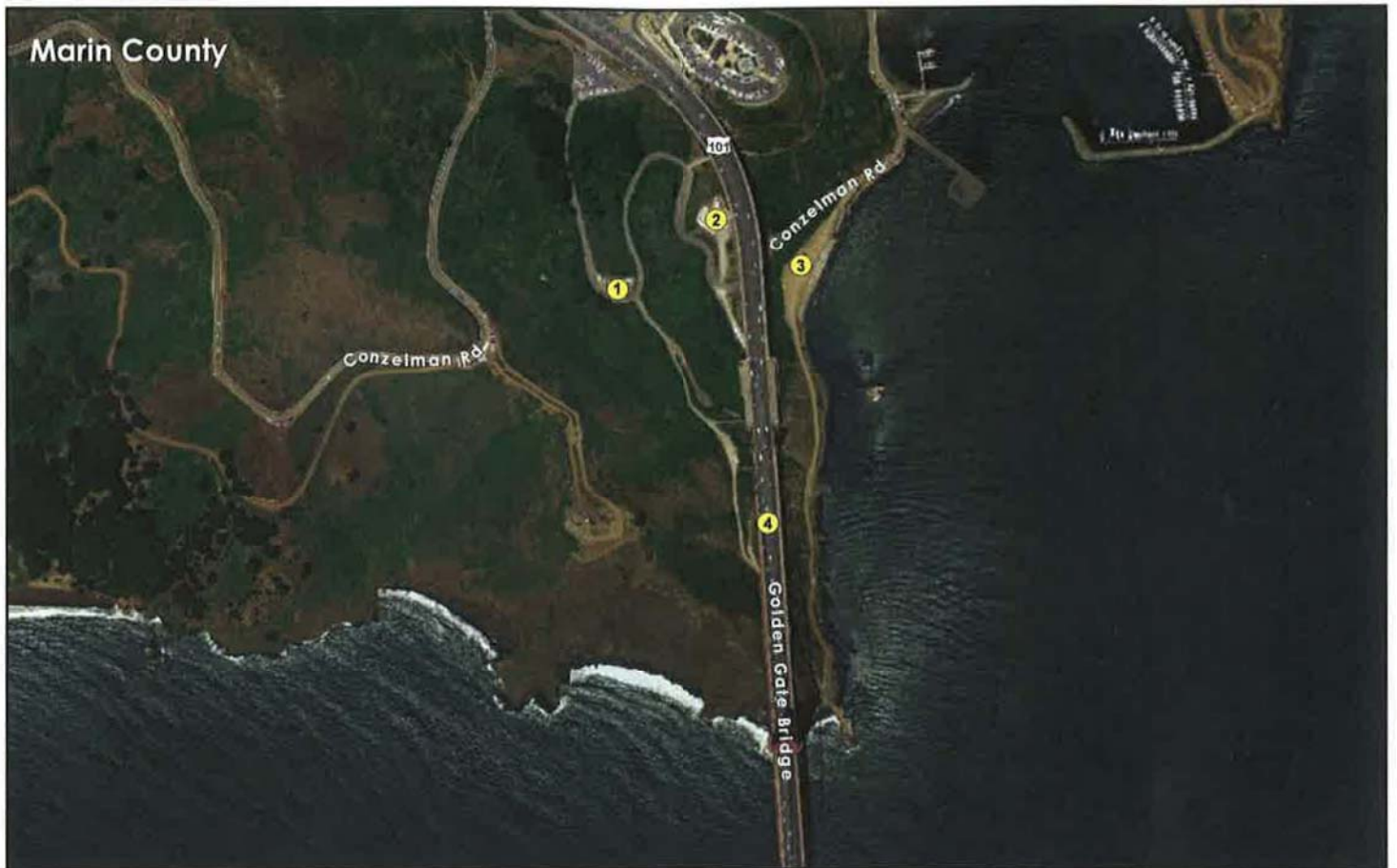
Figure 3: Staging Areas