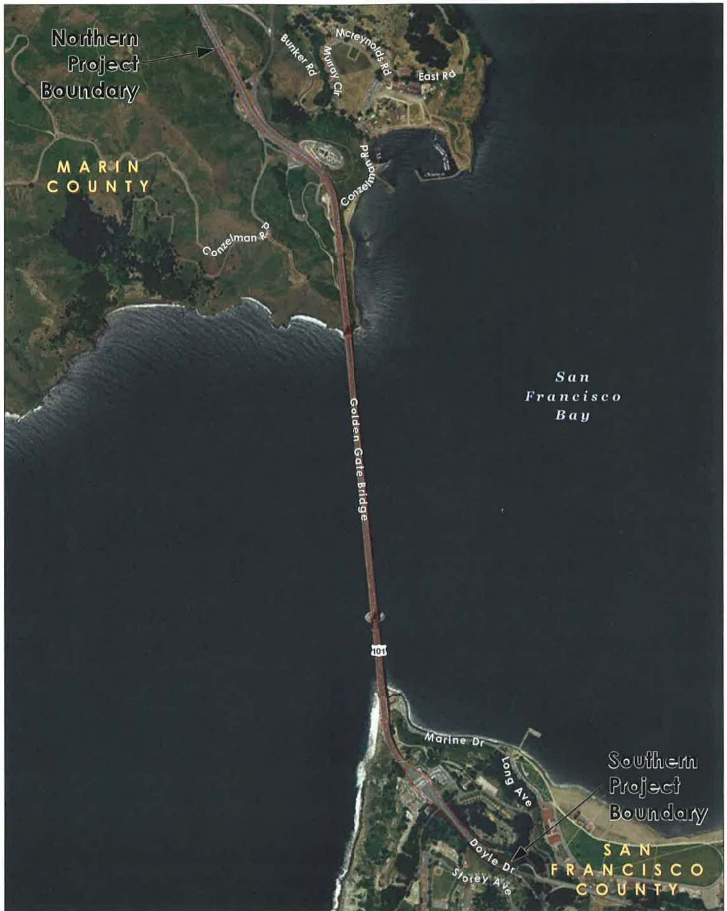
Figure 2: Limits of the Project Area